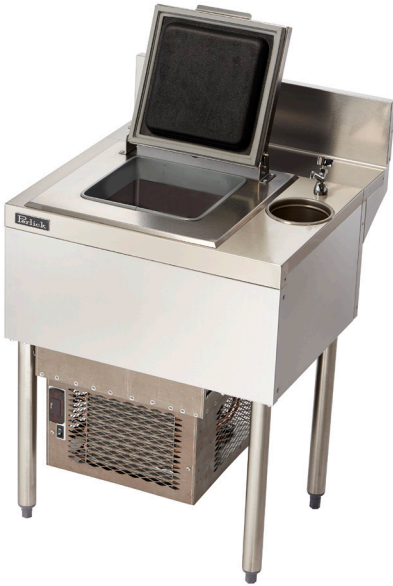
TSD24DC-A shown with 8000A installed